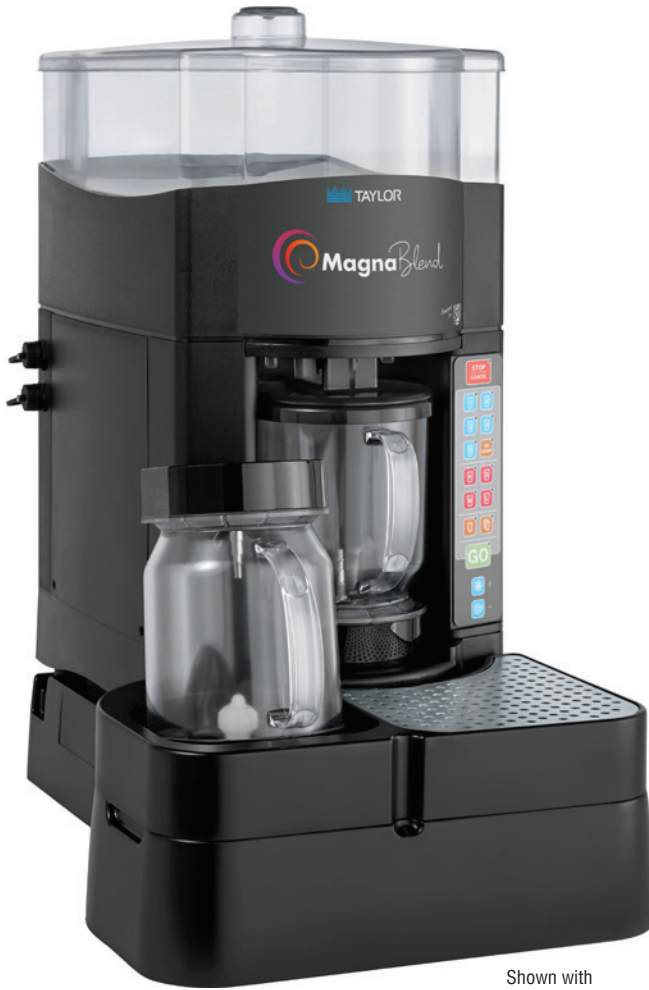
Shown with standard ice hopper