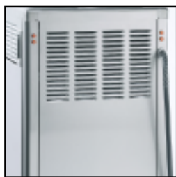
Shown with optional rear mix lights