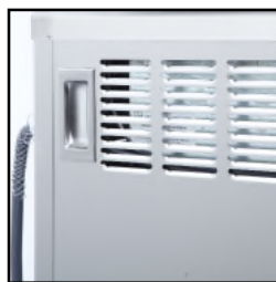
Shown with standard pull handles